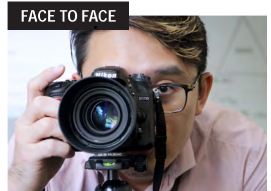
Framing for Better Content