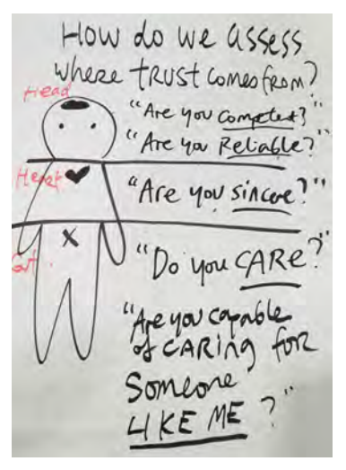
Building trust at multiple levels